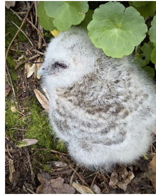
Daisy P —Oak

Here is a flavour of other entries we received!