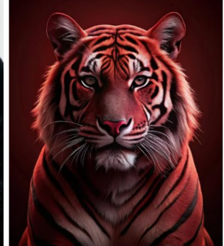
69 house points