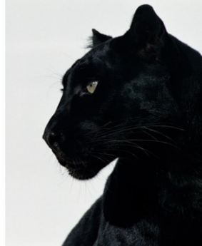
57 house points