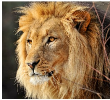
84 house points