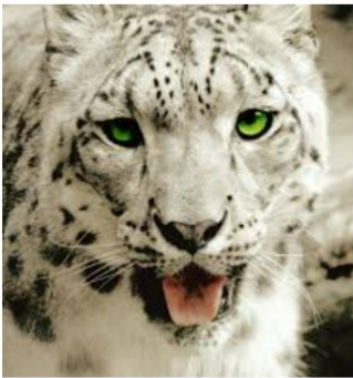
85 House points