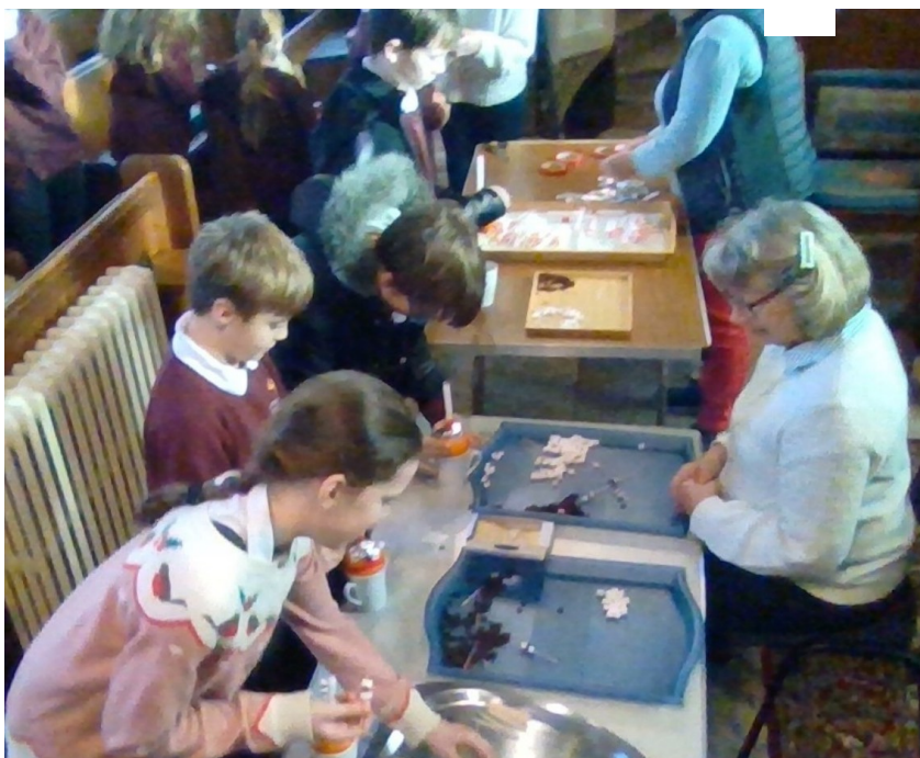
Christingle making In Church!