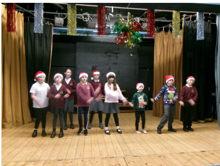
Singing Club did a brilliant job singing some Christmas classics to the school on Wednesday!